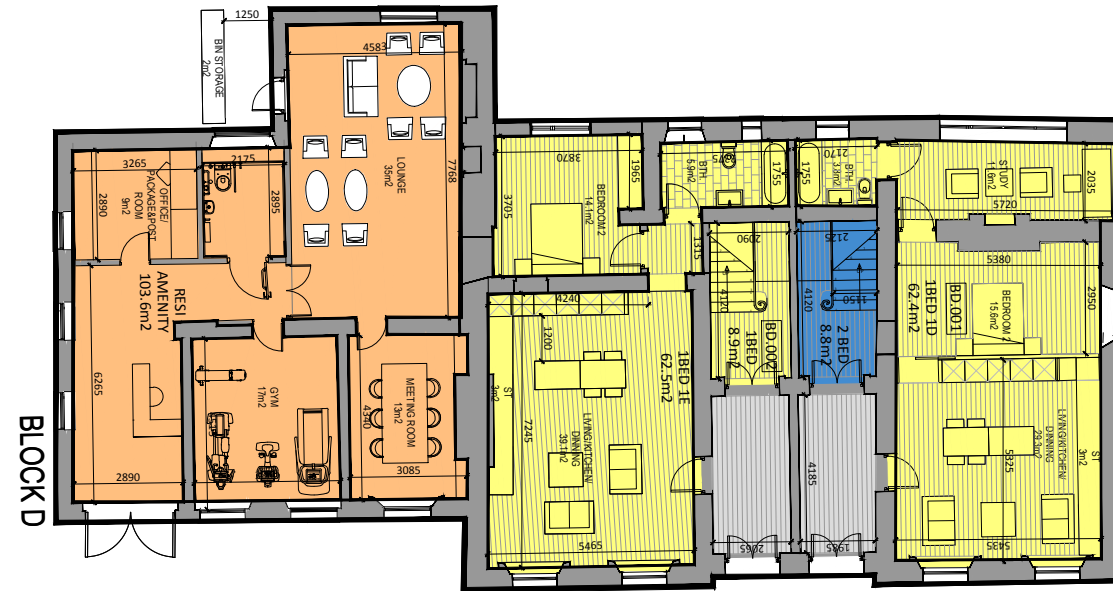
GROUND FLOOR PLAN ESC: 1/200